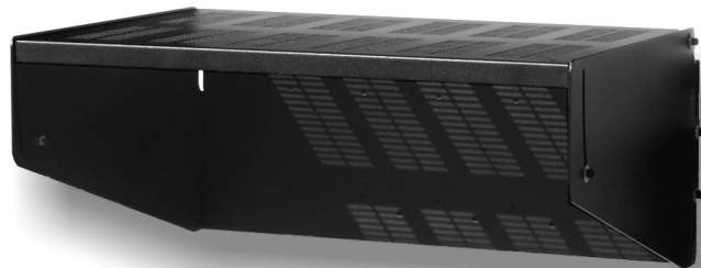
Media Projection Shelf